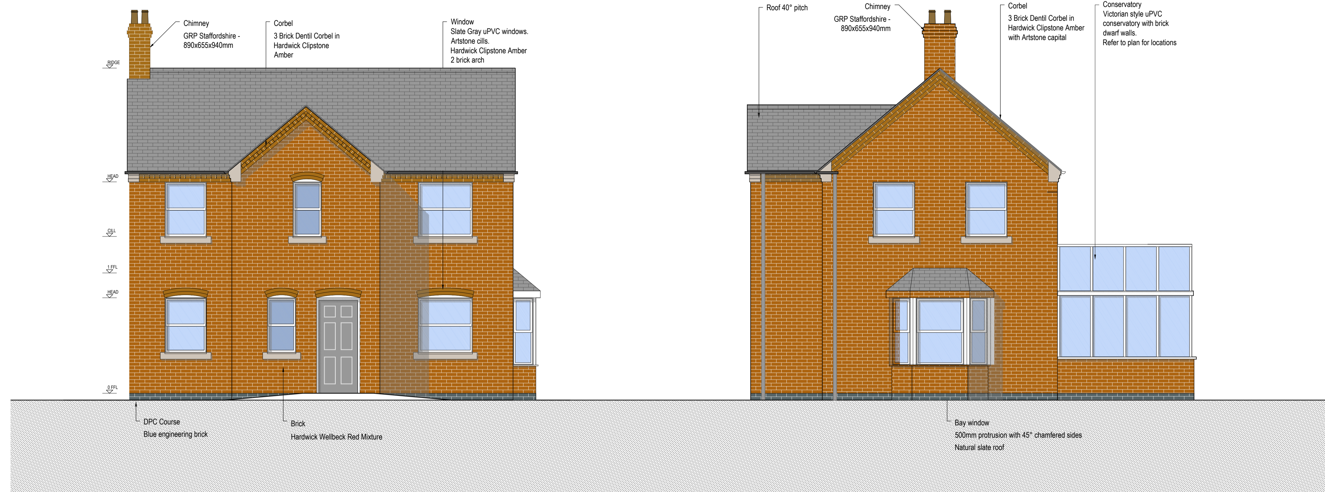
A Front Elevation