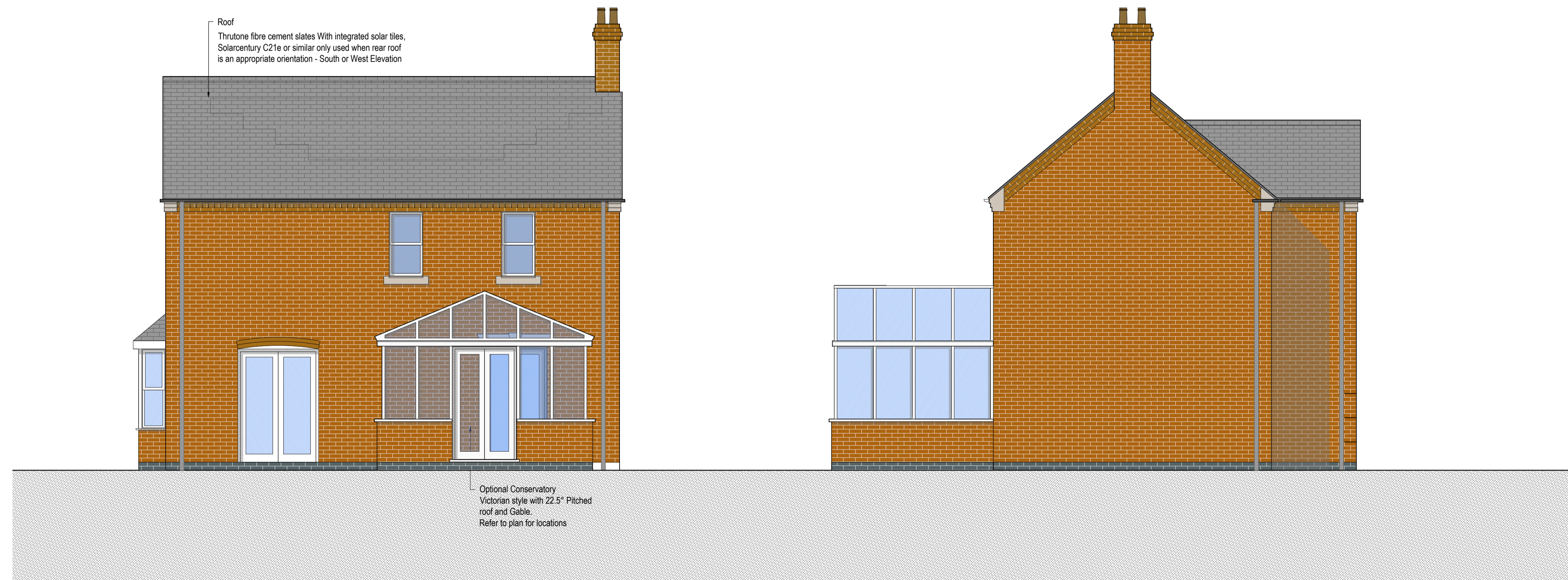
C Rear Elevation